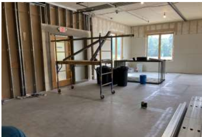
An empty space ready for the contractor's workmen